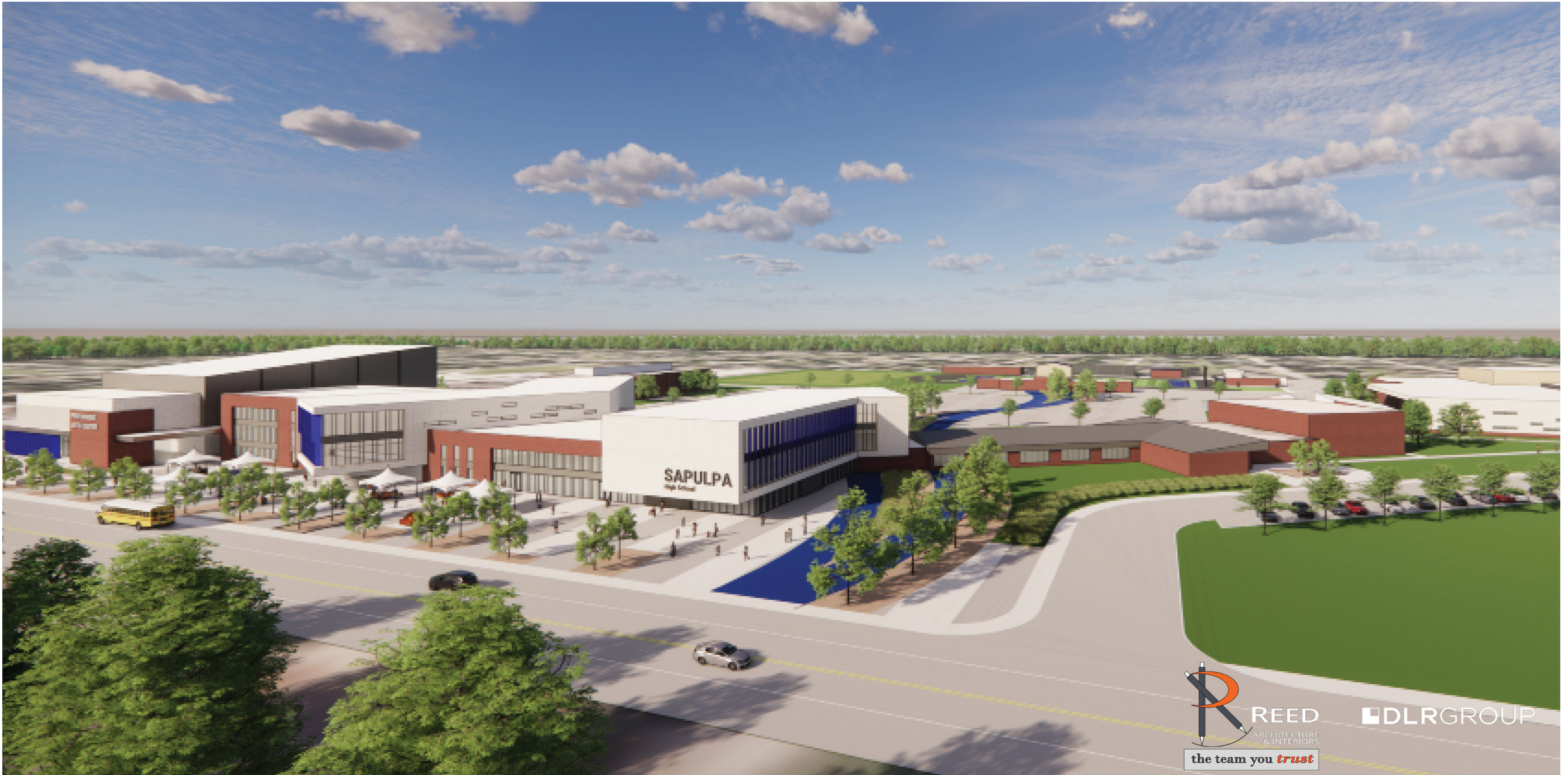
Rendering is for illustration only. The design will be developed with staff and community input.

Sapulpa Public Schools is Proposing a Bond Election on September 12, 2023